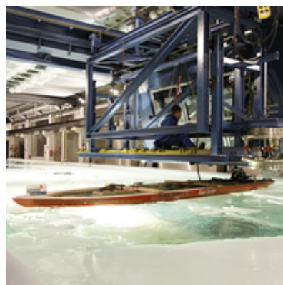
Ice model tests by Aker Arctic Technology in Helsinki, Finland